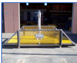
Basket with hinged down sides