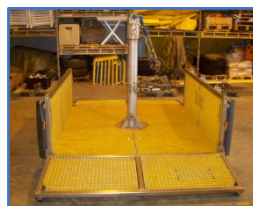
Diver Basket w/o brackets