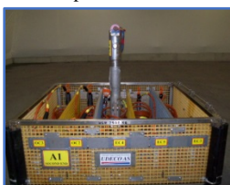
EFL / OFL Basket