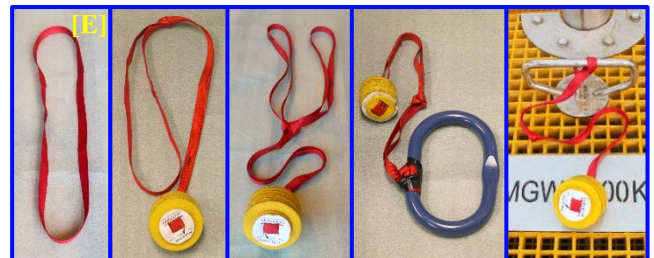
Attachment using the standard extension strap [E] tied to a loop integrated in the fist strap.

* Lengths are inclusive of the 0,5m long standard extension strap [E]. Other lengths on request.