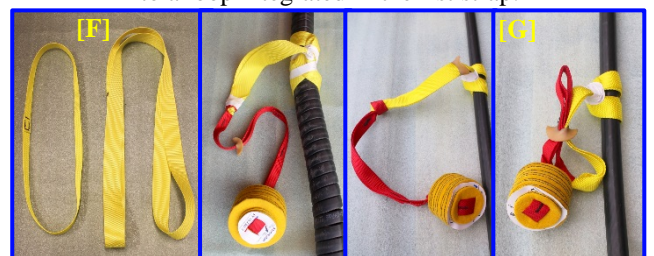
Attachment to cables, hoses, jumpers or other, using the anti-slip webbing loops [F], with or without, temporary strap shortening ring [G].