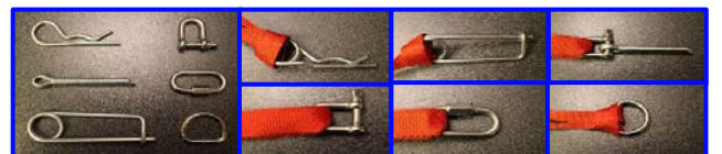
Attachment with 'attachment accessories' (with or w/o standard extension strap). The accessories includes stainless steel D-shackles, R-clip, Spring lock pin, Cotter pin, D-ring, Quick link, and similar.

Delivery include relevant User Guide / Procedure for configuration, adjustment and attachment of fists.