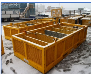
Basket with compartments for Electrical / Optical Flying Leads