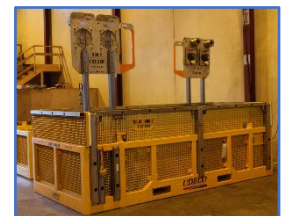
Basket with Single and Dual MQC Parking Stands and Side Extensions